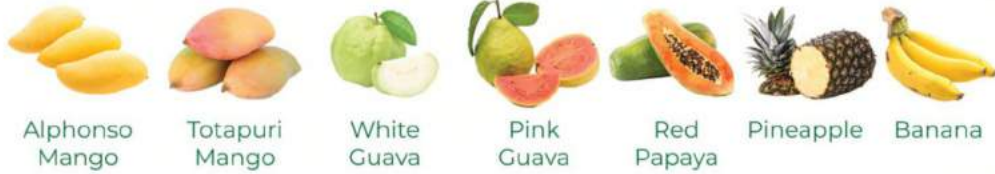
Alphonso Mango Totapuri Mango White Guava Pink Guava Red Papaya Pineapple Banana