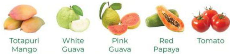
Totapuri Mango White Guava Pink Guava Red Papaya Tomato