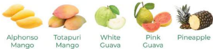
Alphonso Mango Totapuri Mango White Guava Pink Guava Pineapple