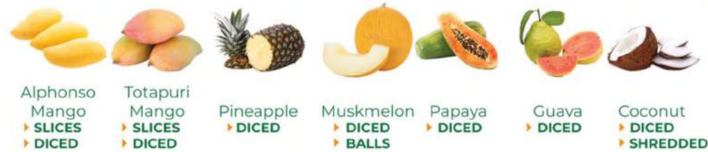
Alphonso Mango ▶ SLICES ▶ DICED Totapuri Mango ▶ SLICES ▶ DICED Pineapple ▶ DICED Muskmelon ▶ DICED ▶ BALLS Papaya ▶ DICED Guava ▶ DICED Coconut ▶ DICED ▶ SHREDDED