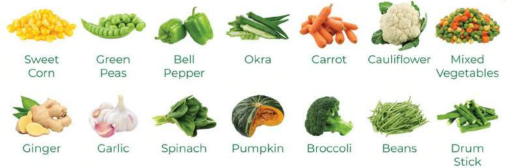
Sweet Corn Green Peas Bell Pepper Okra Carrot Cauliflower Mixed Vegetables Ginger Garlic Spinach Pumpkin Broccoli Beans Drum Stick