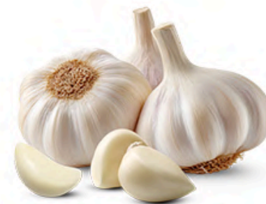
Garlic Puree | Paste Cloves | Dices