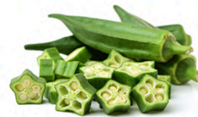
Okra Whole | Cuts