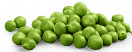
Green Peas Whole