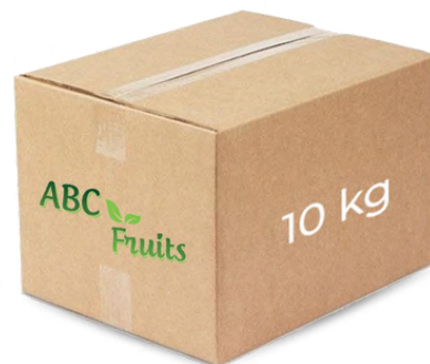
10 kg Cartons