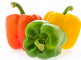
Bell Pepper Dices | Strips