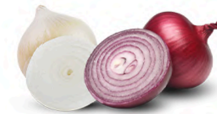
Onion Puree Slice | Dices