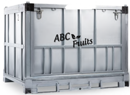
1500 Kg Bins