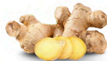
Ginger NFC | Puree | Paste Dices | Slice | Whole