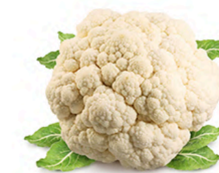
Cauliflower Florets | Rice