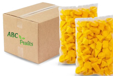
4 - 2.5 kg Bags in Cartons (Food service)