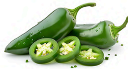
Jalapeno Puree | Concentrate Whole | Rings