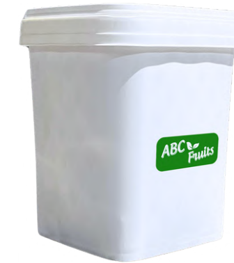
10 - 15 kg Frozen Pail