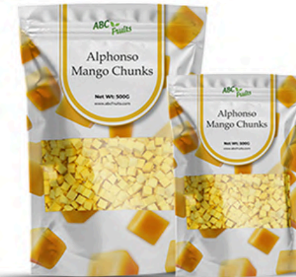
Custom Packaging (Retail)