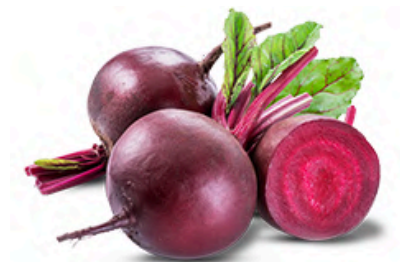
Beetroot NFC | Puree | Concentrate Dices | Chunks