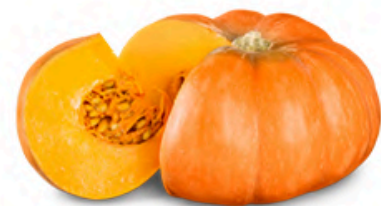
Pumpkin Puree Dices | Chunks