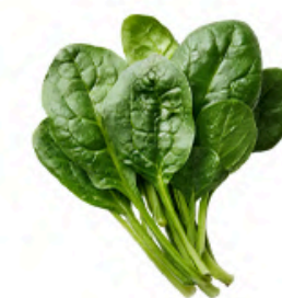
Spinach Puree Chopped | Blocks