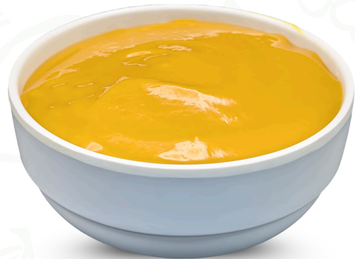
ASEPTIC PUREES, CONCENTRATES & JUICE