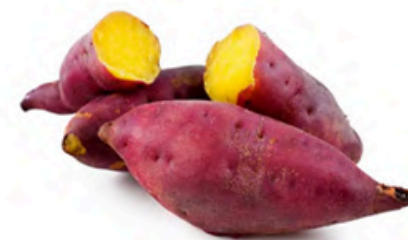
Sweet Potato Dices | Chunks