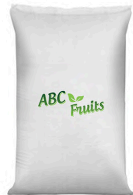
25 - 30 Kg PP Woven Bags