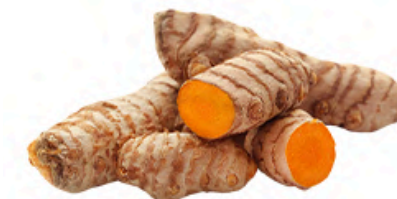
Turmeric Puree Dices | Whole