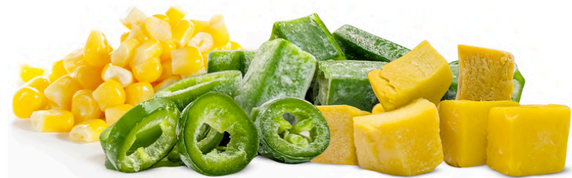
IQF & FROZEN FRUITS AND VEGETABLES