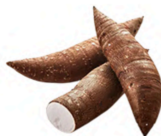
Cassava Puree | Concentrate Dices | Chunks