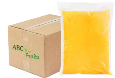
1 - 3 kg Frozen Puree