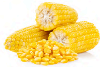
Sweet Corn Puree Kernel & Cob