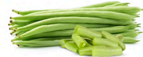
Beans Whole | Cuts