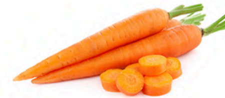
Carrot NFC | Concentrate Dices