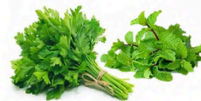
Mint & Coriander Puree Chopped | Blocks