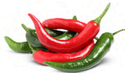
Hot Peppers Puree Whole | Rings