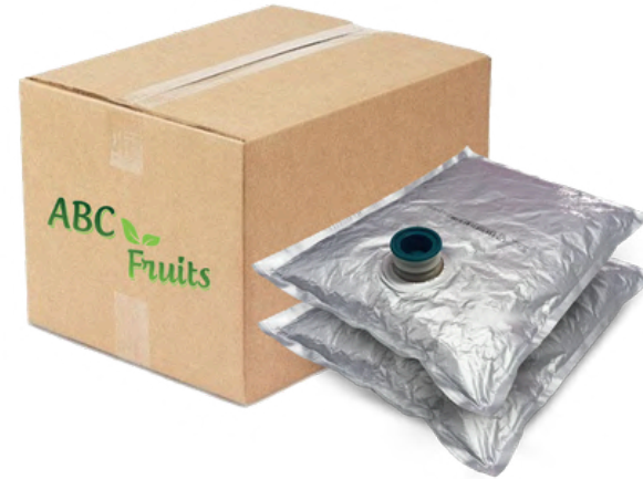
20kg Bag in Box