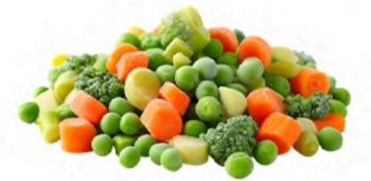
Mixed Vegetables Dices | Cuts